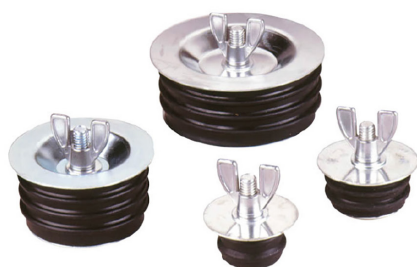
Metal Wing Nut Test Plugs