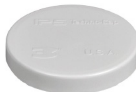
Glue on Test Caps