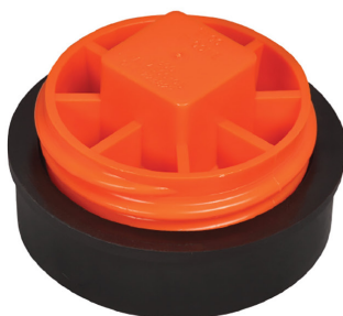
T-Cone Combination Cleanout Test Plugs