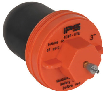
Pneumatic Cleanout Test Plugs