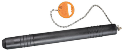
Pressure Relief Long Pneumatic Test Plugs