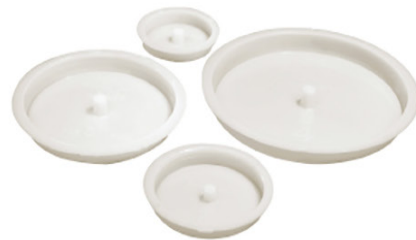
Low Pressure Glue on Test Caps