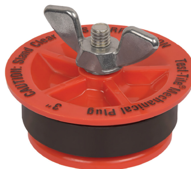
Twist-Tite Mechanical Test Plugs