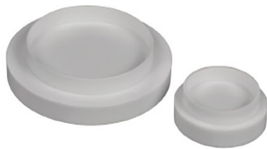
Medium Pressure Glue On Test Caps