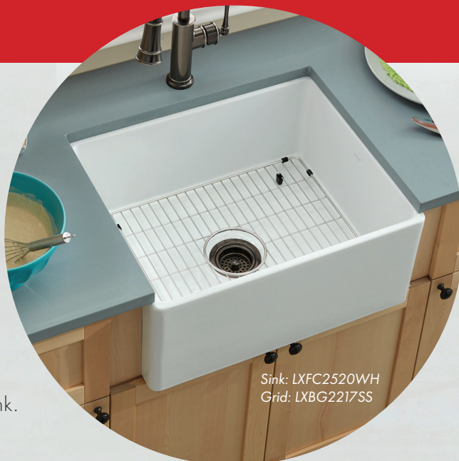
Sink: LXFC2520WH Grid: LXBG2217SS