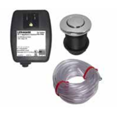
Shown: LX944600 TF-1 Appliance Control Safety Air Switch Single Outlet with Button, 6' Tubing