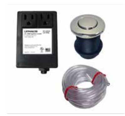
Shown: LX944620 TF-1 Dual Appliance Control Dual Safety Air Switch Dual Outlet with Button, 6' Tubing