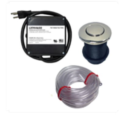
Shown: LX944650 ES-2P Air Actuated On/Off Swith Dual Outlet with Button, 3' cord 1-3/8 Diameter hole required for all buttons