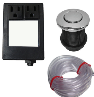
Shown: LX152 TF-1 Dual Appliance Control Dual Safety Air Switch Dual Outlet with Button, 6' Tubing