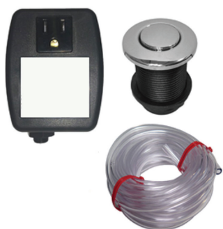
Shown: LX150 TF-1 Appliance Control Safety Air Switch Single Outlet with Button, 6' Tubing