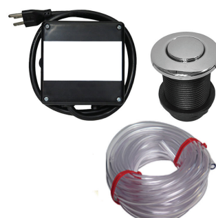
Shown: LX152C ES-2P Air Actuated On/Off Switch Dual Outlet with Button, 3' cord 1-3/8 Diameter hole required for all buttons