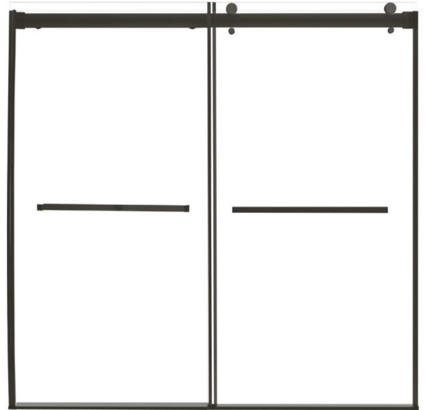
Matte Black Finish Pictured