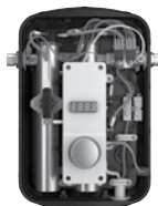
RTEX-08, RTEX-11, RTEX-13